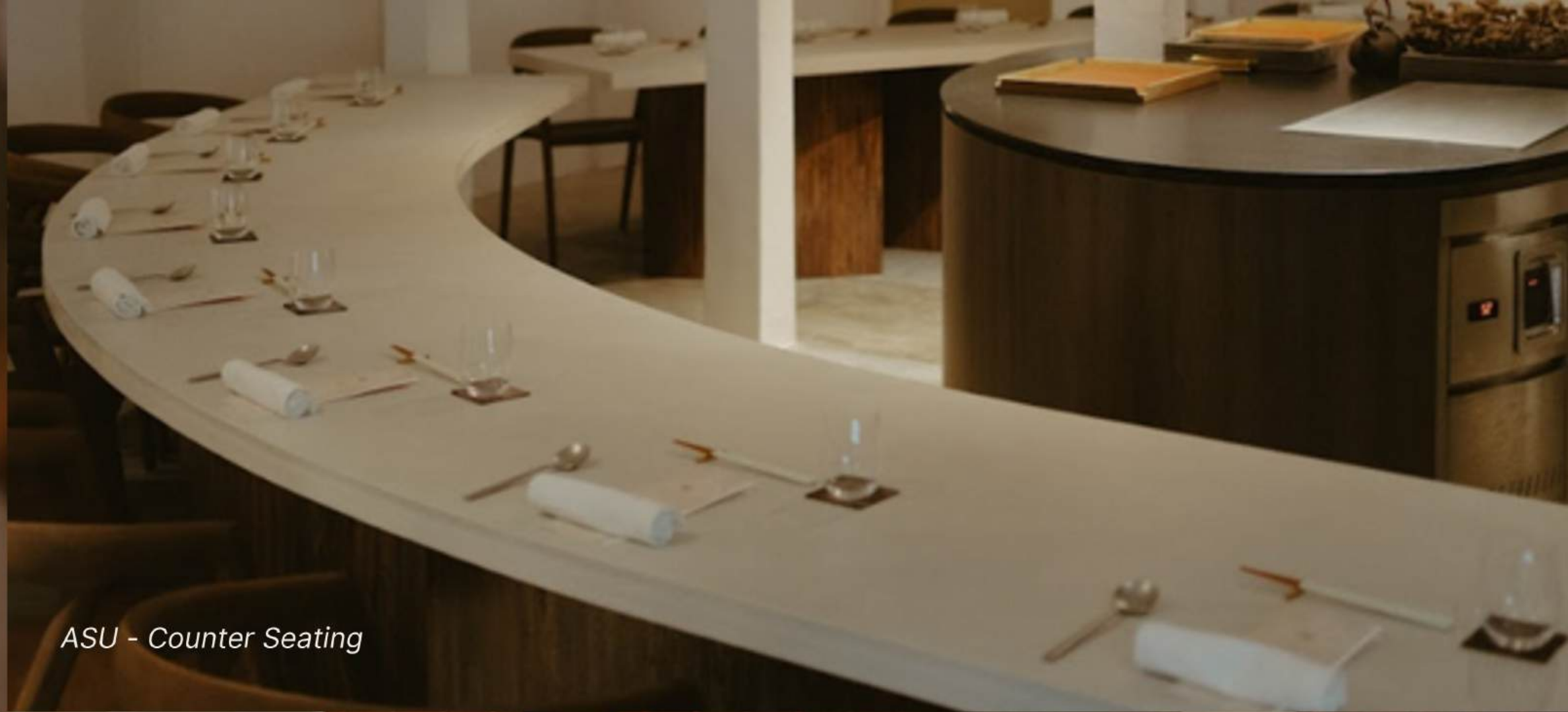
ASU - Counter Seating