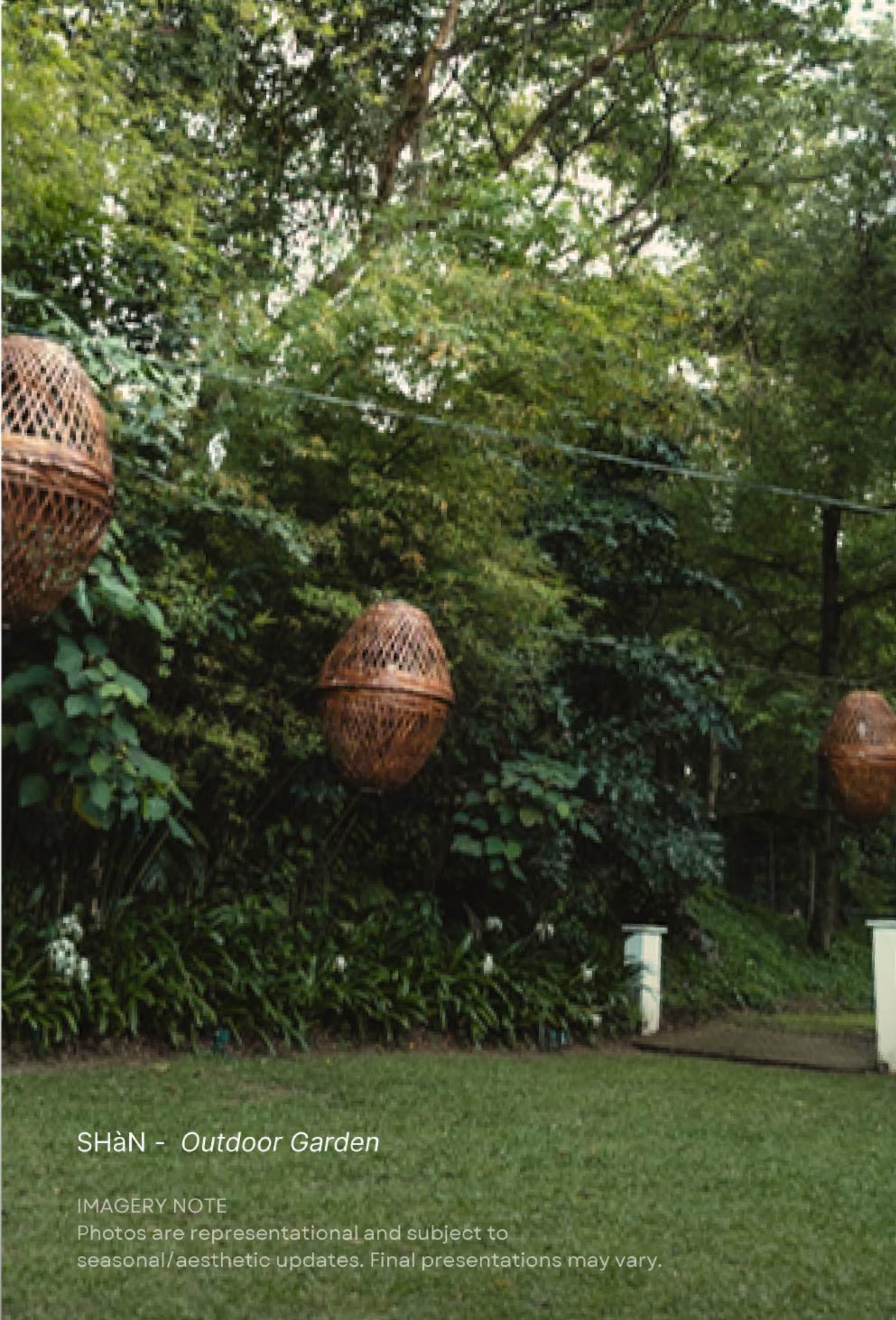
SHÀN - Outdoor Garden

IMAGERY NOTE Photos are representational and subject to seasonal/aesthetic updates. Final presentations may vary.