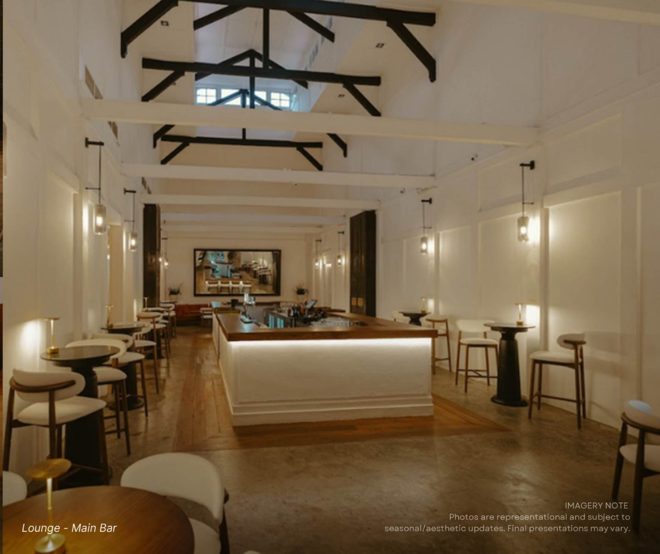
Lounge - Main Bar

IMAGERY NOTE Photos are representational and subject to seasonal/aesthetic updates. Final presentations may vary.