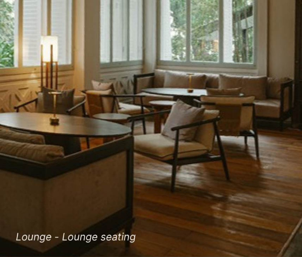
Lounge - Lounge seating