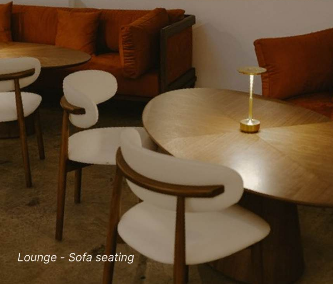
Lounge - Sofa seating