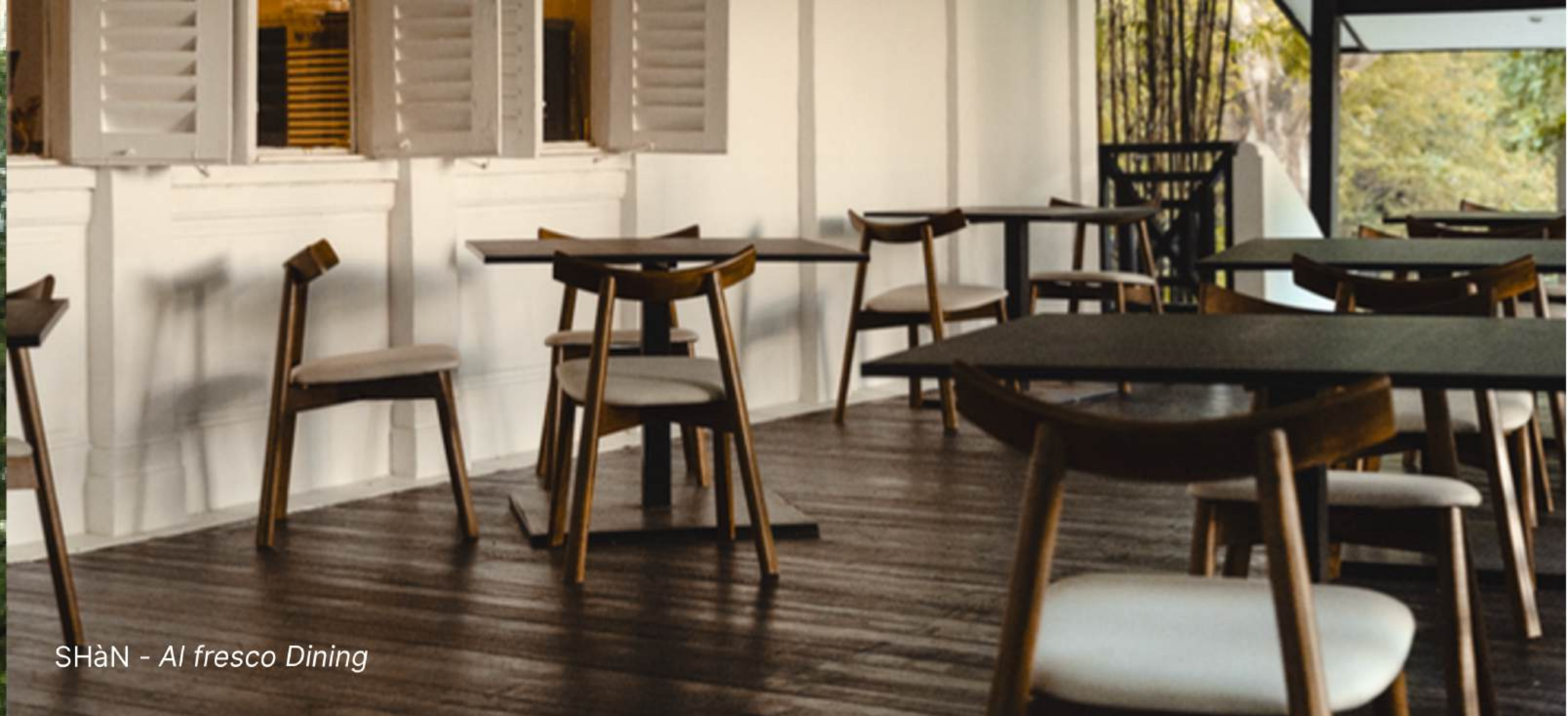
SHÀN - Al fresco Dining

IMAGERY NOTE Photos are representational and subject to seasonal/aesthetic updates. Final presentations may vary.