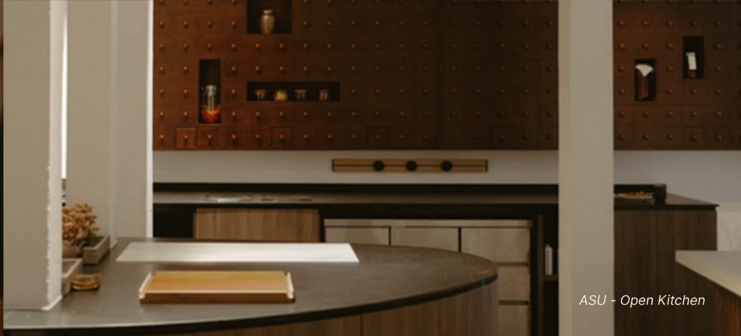
ASU - Open Kitchen