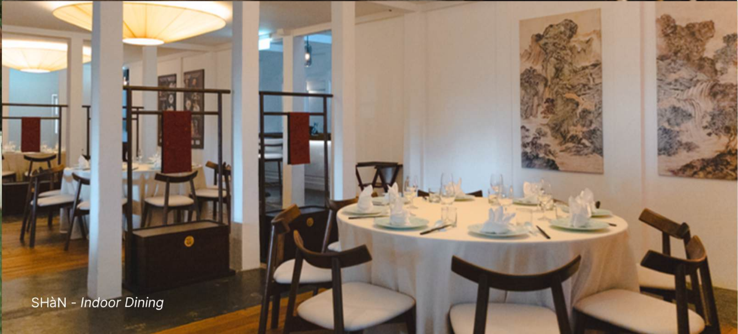
SHÀN - Indoor Dining